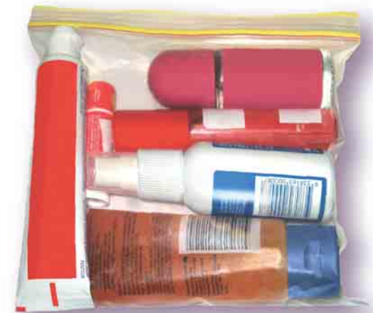
Size about 20 x 20cm